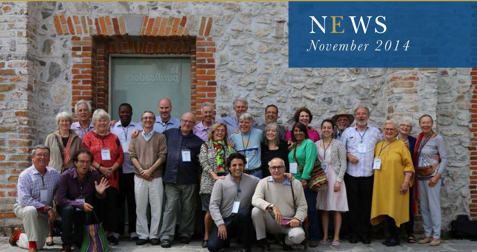
« The MSF Team, WSA directors and friends at the World Congress, Puebla.