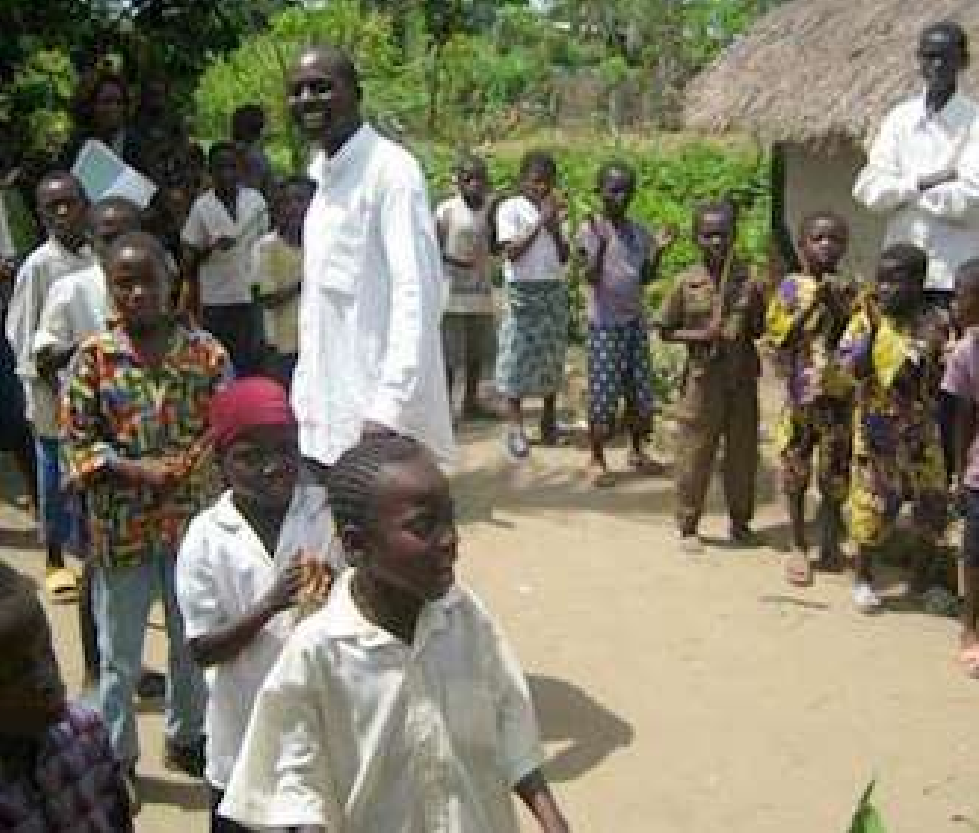
Children from the Albadi home in DR Congo.