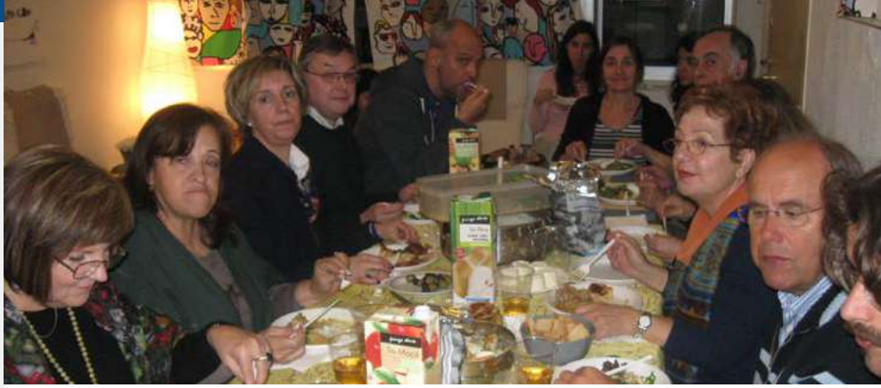
Members of Subud Portugal gather for a meal at their Subud house.

http://www.msuhfoundation.org/grants/apply-for-a-grant/