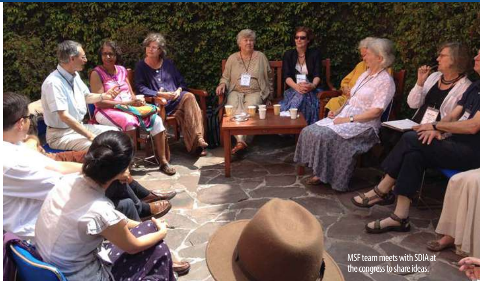
MSF team meets with SDIA at the congress to share ideas.