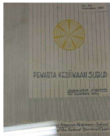
The first Pewarta - one of the thousands of printed materials in the Gilandak archives.

During his lifetime Bapak gave more than 1,700 talks but only 1,316 remain and many of these original recorded talks were in danger of deteriorating and being lost forever.