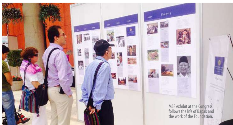
MSF exhibit at the Congress follows the life of Bapak and the work of the Foundation.