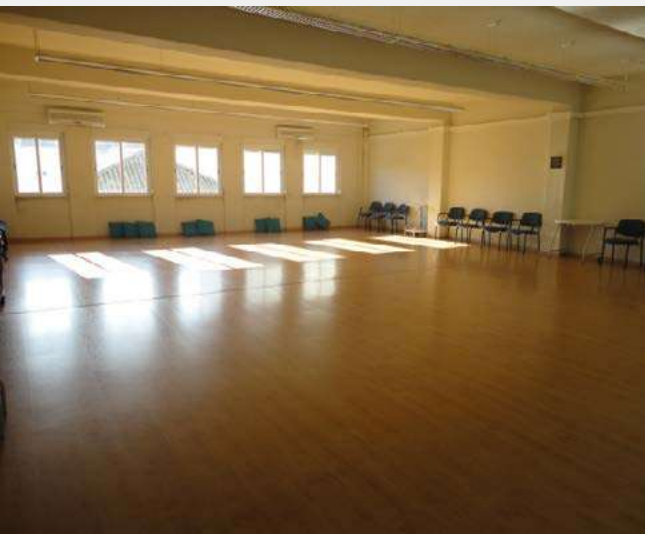
Subud Lisbon latihan Hall.

D uring the Foundation's Annual General Meeting, the Board approved grant requests. Subud Puebla, Mexico, was awarded US $8,000 to expand their current premises. Subud Istmina, Colombia, received US $3,750 for kitchen equipment and to improve electricity connections. Subud Lisbon was awarded a grant of US $24,000 to assist the group in paying off a bank loan for their Subud house.