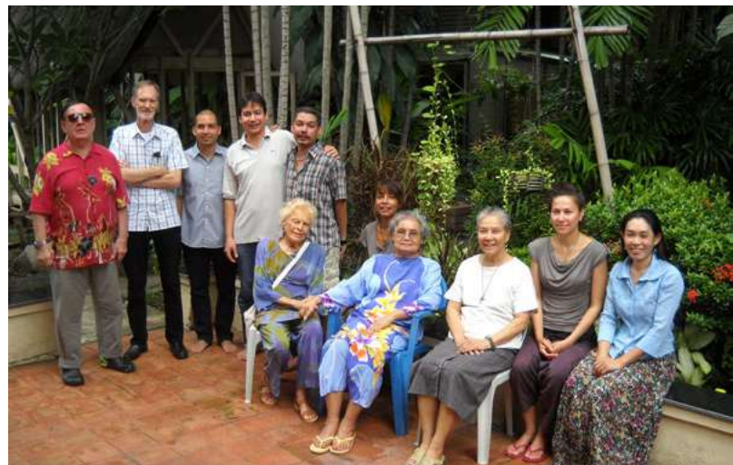
Subud Bangkok Group

Subud Thailand will host the Zones 1 and 2 Meeting from 4-7 October and during that time we will arrange a selamatan to inaugurate the new Subud Hall!