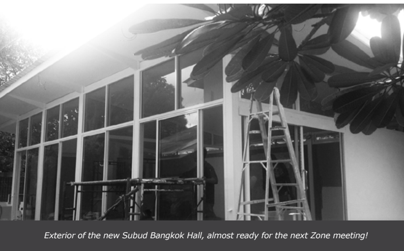
Exterior of the new Subud Bangkok Hall, almost ready for the next Zone meeting!

Rosali Meepaubul Chairperson, Subud Thailand