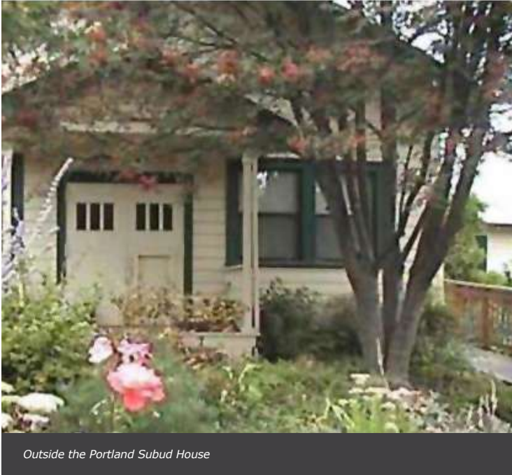
Outside the Portland Subud House