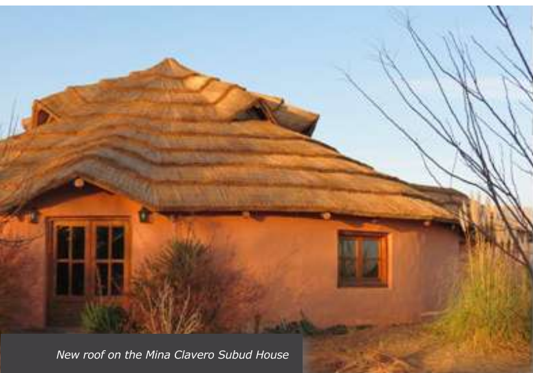
New roof on the Mina Clavero Subud House

The Foundation has been involved with the Subud Group in Mina Clavero since 1996 when they first applied for a loan and grant to create their picturesque Subud House in the mountains of Central Argentina. In 2011 the group requested a new loan to repair the roof.