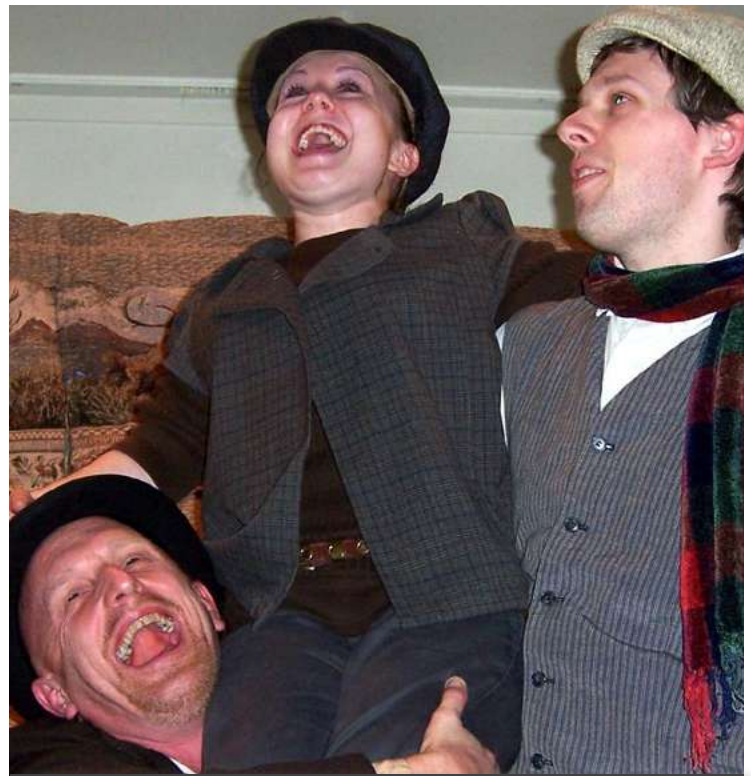
The Masque Alfresco theater group is headquartered at the Portland Subud House

Part of what makes Subud Portland so active and culturally vibrant is that my theatre, Masque Alfresco, is headquartered at the Portland Subud House. We are into our 12th year of providing Summer Park Tours, bringing modern, updated versions of commedia dell'arte plays to parks throughout greater Portland - FREE to the general public, family friendly, multi-generational, with contemporary references: celebrity slams & political jokes - yet retaining all the charm of commedia traditions: slapstick beatings, hat lazzi, colorful period costumes. We also add songs & raps & funky movement ballets.