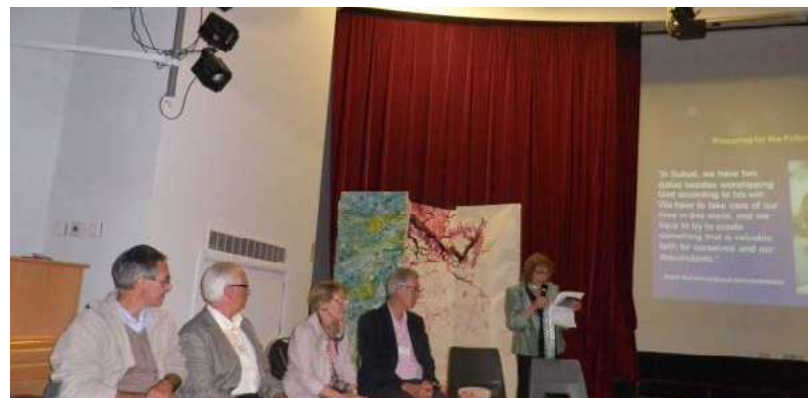
The MSF team at the UK 'premiere' of the films at the European Gathering & Subud Britain Congress in Malvern in August. A lively Q&A followed with many members wanting to know more about the work of the Foundation and the Legacy Project.

BPI www.borneoproductionsinternational.com begin. www.beginchange.co