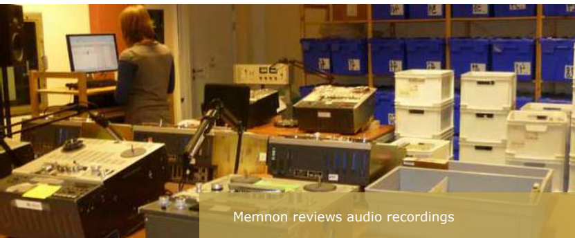
Memnon reviews audio recordings

The percentage of problem recordings has since increased in number