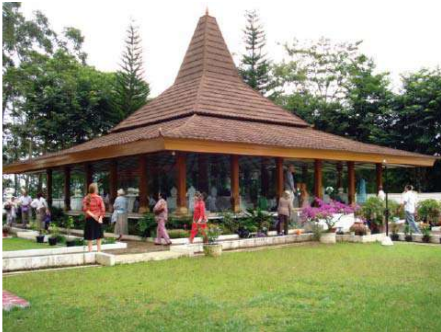
Cover photo & above: Subud members paying their respects at Bapak's gravesite, Suka Mulya, Indonesia.