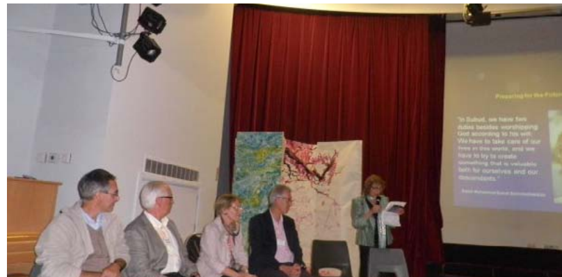
The MSF team at the UK 'premiere' of the films at the European Gathering & Subud Britain Congress in Malvern in August. A lively Q&A followed with many members wanting to know more about the work of the Foundation and the Legacy Project.

BPI www.borneoproductionsinternational.com begin. www.beginchange.co