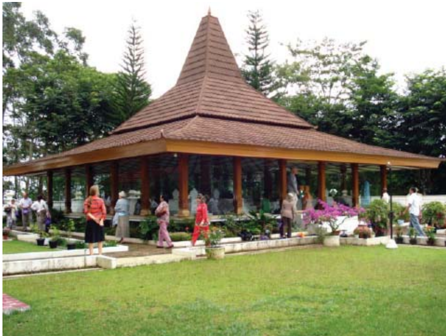
Cover photo & above: Subud members paying their respects at Bapak's gravesite, Suka Mulya, Indonesia.