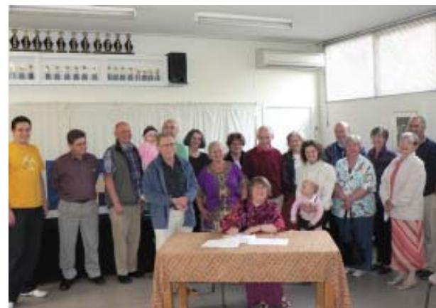
Thanks in part to funds received from the Parker Fund, a 99-year lease has been signed to secure a site in Canberra for the establishment of the Australian National Subud Centre. The signing ceremony is pictured above.