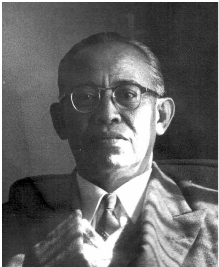
Bapak Muhammad Subuh Sumohadiwidjo